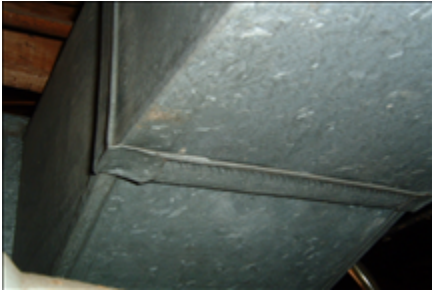
Air leak in duct seam