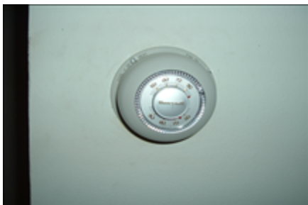
Replace analog manual thermostat

Recommend taking advantage of a setback programmable thermostat. Depending on lifestyle, setting back at least five to ten degrees for eight hours during sleep hours and/or at times when home is unoccupied will potentially save ten to fifteen percent on energy costs.