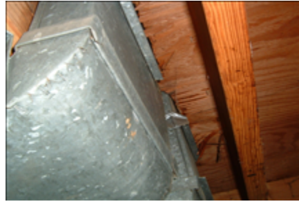
Air leakage noted in duct boot.